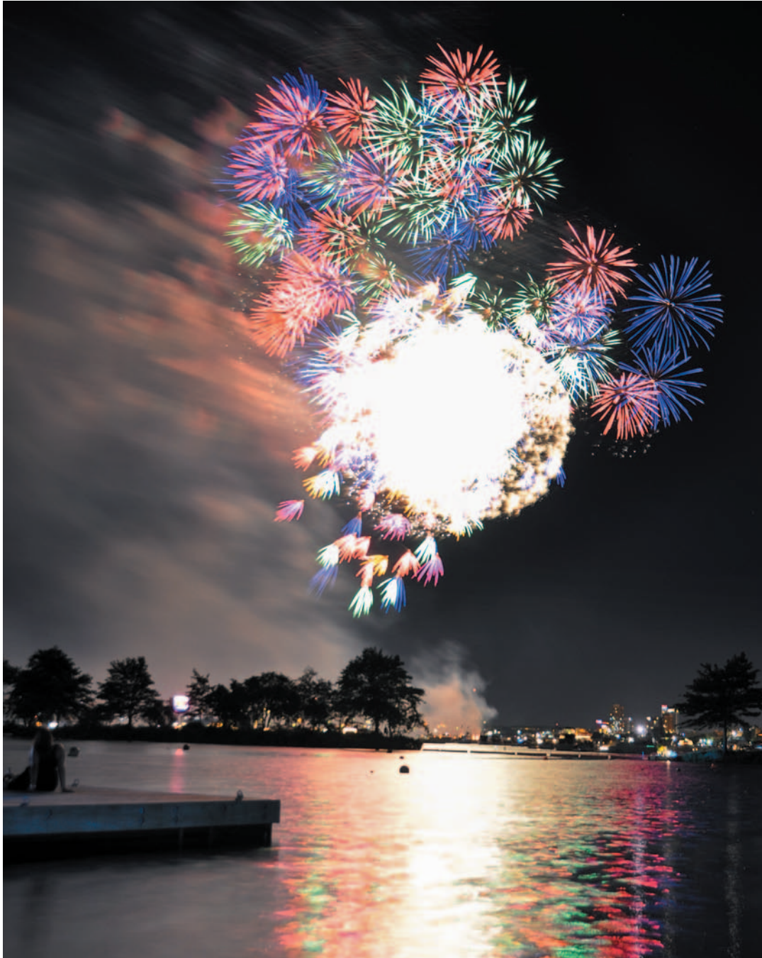
Fourth of July on the Charles River

Copyright © 2012 Massachusetts Medical Society.